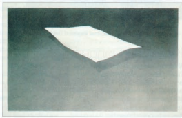
Ed Ruscha, Suspended Sheet Stained with Ivy , 1973, gunpowder and ivy on paper, 14" x 22".

Two of the most memorable works occupied opposite poles within the show's narrow parameters. John Cage's River Rock and Smoke , 4/13/90, #12 is a tall, narrow watercolor on paper that delicately conveys the abstraction within nature's vastness. At the other extreme, Jasper Johns's untitled 1991 ink-on-Mylar piece is brilliantly dense