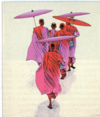
Min Wae Aung, Towards Monastery , 2008, acrylic on canvas, 60" x 51", art-urban.

Min Wae Aung's paintings are studies in the contrast between the austerity of the subject matter—Burmese monks and monastery novices nearly always shown with their backs to the viewer—and the garishness of the artist's palette of hot pink, bloodred, fluorescent yellow. What results are idealized figures that are at once meditative and humorous, and devoid of earnestness.