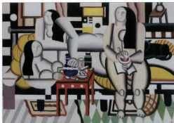
Fernand Léger, Le Grand Déjeuner , 1921, oil on canvas, 25" x 36", Malingue.

This remarkable exhibition showcasing 15 major paintings by Fernand Léger highlighted several of the most important